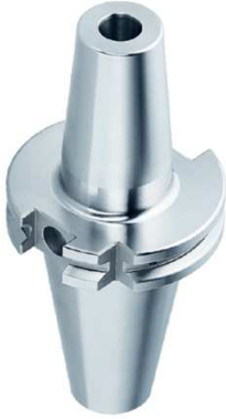
SK SHRINK TUTUCU