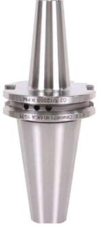
Vidalı Tip Frezeler İçin Takım Tutucular