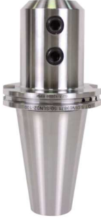
Veldon tutucu Silindirik Şaftlı